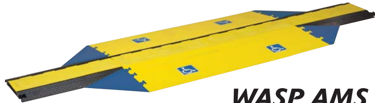
WASP AMS (Double Wide)